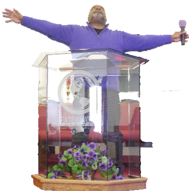
An affiliate of World Assemblies of Restoration

In case of inclement weather, call the church 610-444-5581. Once the recording comes on, press 3 to listen for any cancellations and updates.