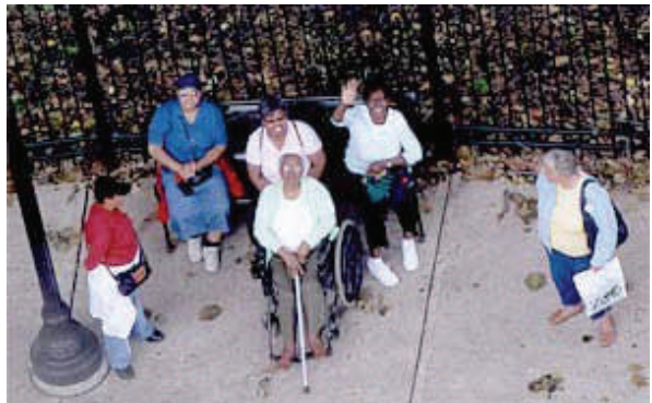
Looking down from the Balloon ride at the

May you have an exalted Christmas and a joyous New Year!