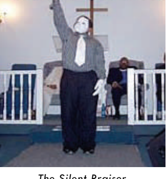
The Silent Praiser

To view more images of this Fellowship go to GWMinistries.net/events/past events