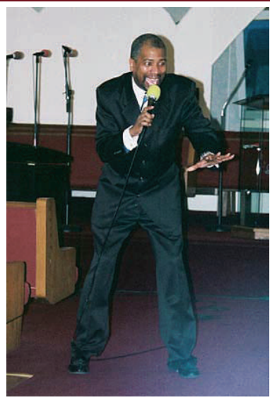
"If you will do the mundane, God will do the miraculous. If you will do the fundamentals, God will do the fantastic."